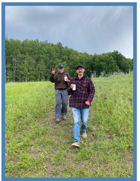
Grades 5~12 Cypress Hills Camping Trip